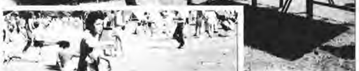
...and the not so famous