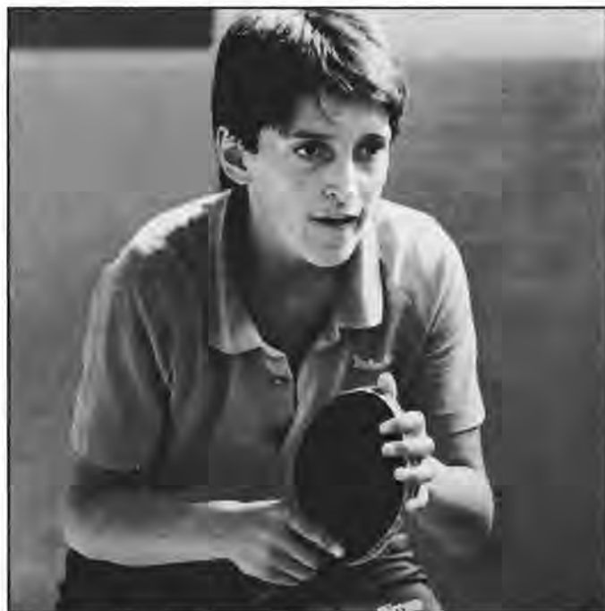
The junior boys title slipped away from Matthew Syed.