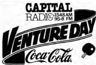
Sponsors, Coca Cola, had no problem giving away their free samples.

Please see that those most susceptible to the actions of the seniors are discouraged from imitating them.