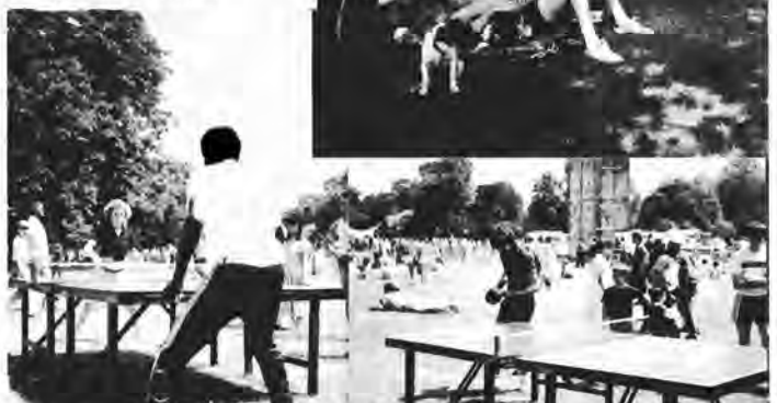
The famous .....

Who said this was the quiet time of year? It seems that there is always someone new waiting to pick up a bat!